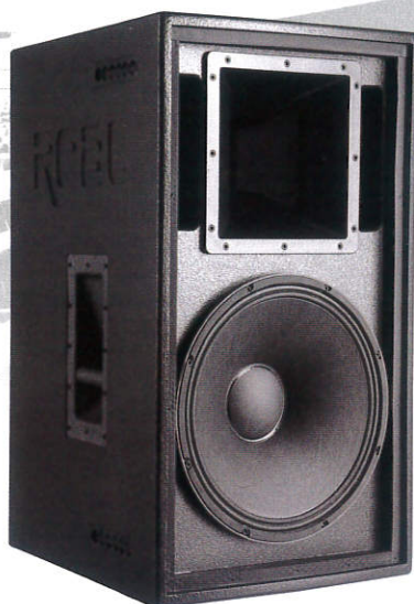
DS-1520 Full Range

A 2-way full range system in a trapezoidal enclosure. Loudspeaker compliment consists of an dual 15inch(75mm voice coil) ferrite magnet LF woofer in a ported sub-enclosure, and a single 2inch (44mm voice coil) ferrite magnet compression HF driver mounted on a 60° x 40° horn. Rotatable 8 positions horn, The loudspeaker enclosure shall be rectangular in shape. It shall be constructed of 18mm thickness high density plywood and shall employ extensive internal bracing. Handles are balance-optimized to facility transportation. perforated steel is employed for frontal protection of the loudspeaker compliment.